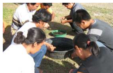
Participants of the ige tuhil contest.