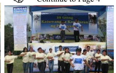
PO of Mainit present their Mulanay dance