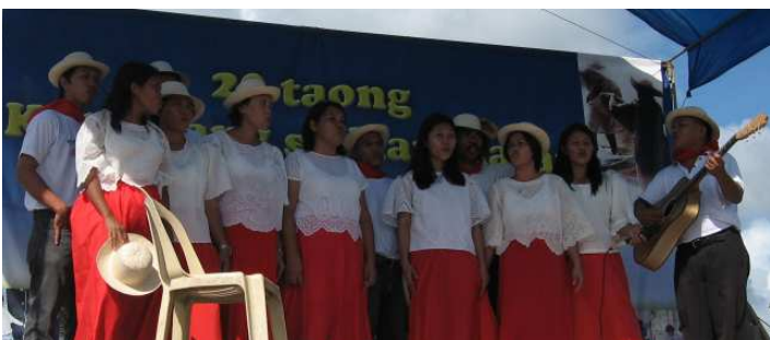
A group of Daygon Contest participant presents their Christmas Carol song.

Series of art, literature and indigenous